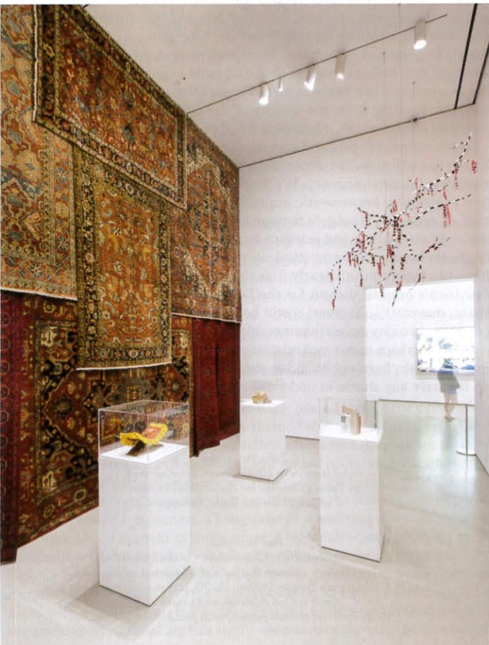
2 Slavs and Tatars Beyonsense , 2012, installation view as part of Projects 98, Museum of Modern Art, New York

W.A.G.E. is an activist group based in New York, USA, that focuses on regulating the payment of artist fees by nonprofit art institutions, and establishing a sustainable model for best practices between cultural producers and the institutions that contract their labour.